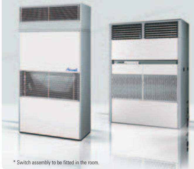
INDOOR UNIT X4650 AO*

* Switch assembly to be fitted in the room.