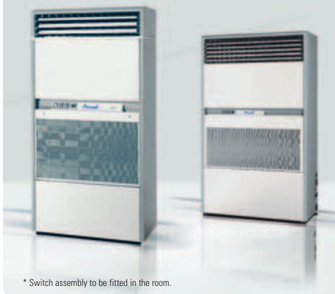
INDOOR UNIT X2450 AR*

* Switch assembly to be fitted in the room.