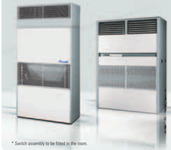
INDOOR UNIT X4650 AO*

* Switch assembly to be fitted in the room.