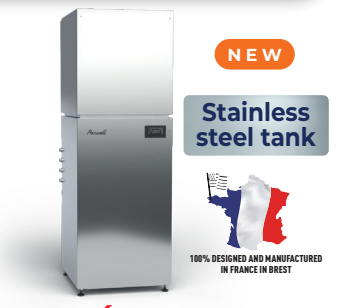
AMZÉO WT Monoblock heat pump 100% indoor