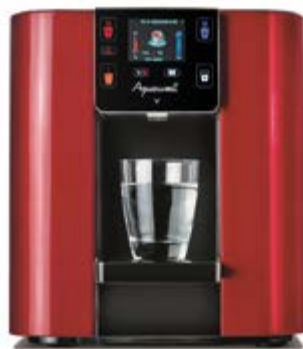
[ RED ]