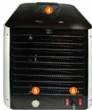
[ REAR VIEW ]