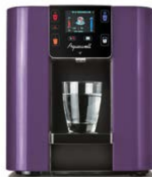
[ PURPLE ]