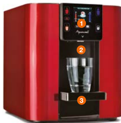
[ FRONT VIEW ]

Grid allow the water to be collected in the removable tray – up to one cup.