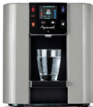
[ GREY ]