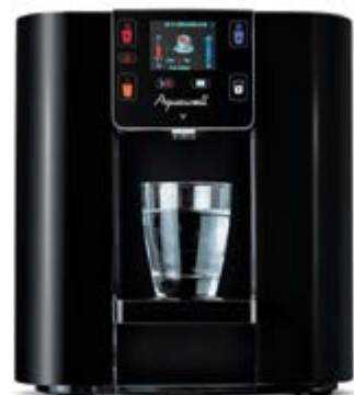
[ BLACK ]