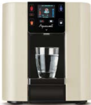
[ CREAM ]