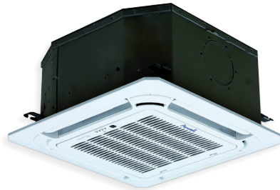
CDMX 022N-025N- 035N-050N