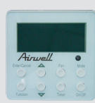
RCWE (included with DAF)