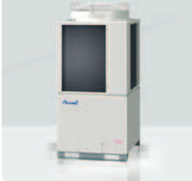
OUTDOOR UNIT MFL 80-100-120-140-160 R

Airwell proposes a new generation of outdoor units with increased performance. Composed of 5 x 8, 10, 12, 14 or 16 HP DC Inverter models, this range enables a capacity range of 48 HP to be covered, by intermixing up to 3 units. The heat performance has been significantly improved: • Average COP 3.9 as opposed to 3.4 for the previous range. • Average EER 3.5 as opposed to 3.1 for the previous range.