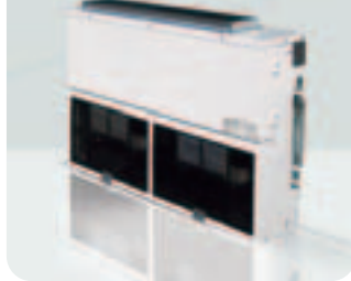
INDOOR UNIT NDSLPL 7-9-12-16-18-22 R