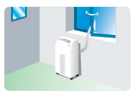
AELIA 7 monobloc model: a simple small diameter condensate drainage link is directed outdoors.

Mounted on castors and compact in size, AELIA air conditoners are a model of manœuvrability. They create a cool, comfortable environment all around the home... in the living room, in the bedroom. Once summer days are over, the AELIA can be easily stored away. Simple!