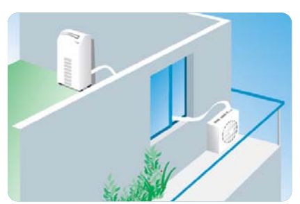
AELIA 10 & 14 split mobiles: a flexible and disconnectable pipe link connects the two parts.