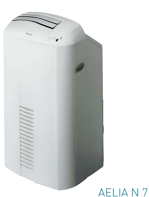
Coolness all summer long