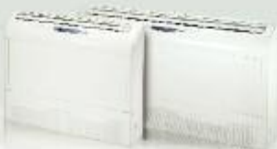
INDOOR UNIT SX TELECOM 12-18-30