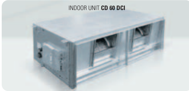
INDOOR UNIT CD 60 DCI