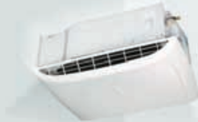
INDOOR UNIT MD 35-38-50

5 Heat Pump models From 9,1 kW to 14,5 kW