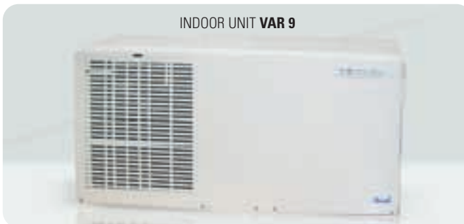
INDOOR UNIT VAR 9