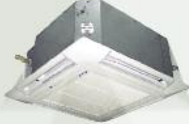
INDOOR UNIT CKF 009-012-018

7 Heat Pump models From 2,85 kW to 13,2 kW