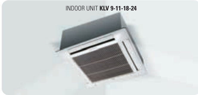
INDOOR UNIT KLV 9-11-18-24

7 Cooling models From 2,65 kW to 12,5 kW 7 Heat Pump models From 2,98 kW to 14,2 kW