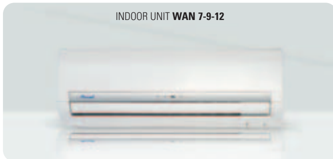
INDOOR UNIT WAN 7-9-12

3 Cooling models From 2,0 kW to 3,5 kW 3 Heat Pump models From 2,1 kW to 3,8 kW