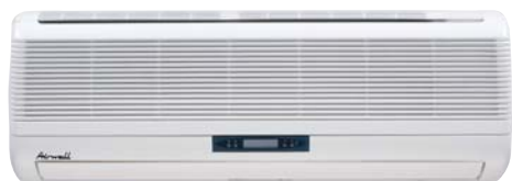
FLO 7/9/12/14 N