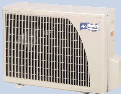
GCNG 7/9/12/14 RC

The heat-stable polyester material structure provides a reduction in the noise level, weight and a prolonged service life. The anticorrosion treatment with a High density powder paint coating ensures high resistance whatever the operating conditions.