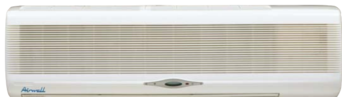
FLO 30 N