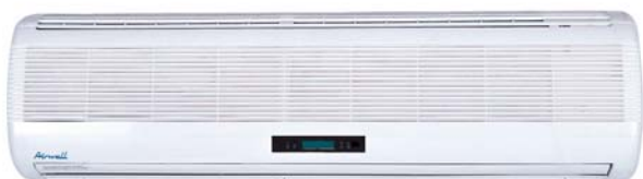
FLO 18/24 N