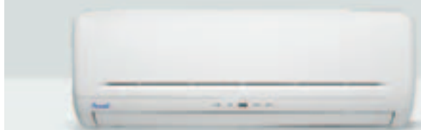
INDOOR UNIT HFD 007-009

3 Heat Pump models From 2,2 kW to 3,5 kW