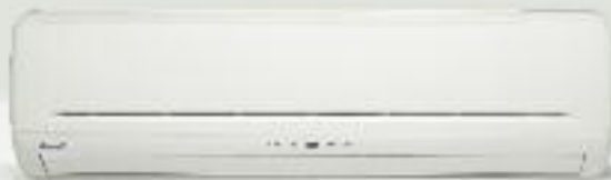
INDOOR UNIT HFD 012-018