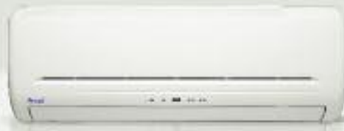
INDOOR UNIT HFD 007-009

4 Heat Pump models From 2,2 kW to 5,3 kW