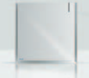
INDOOR UNIT XLF 9-12 DCI

2 Heat Pump models From 2,5 kW to 3,5 kW