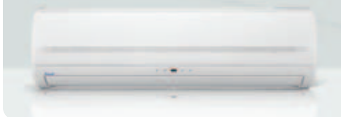
INDOOR UNIT WDI 7-9-12-18

4 Heat Pump models From 2,5 kW to 5,3 kW