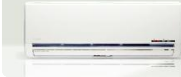
INDOOR UNIT PNX0 09-12 DCI

6 Heat Pump models From 3,4 kW to 8,5 kW