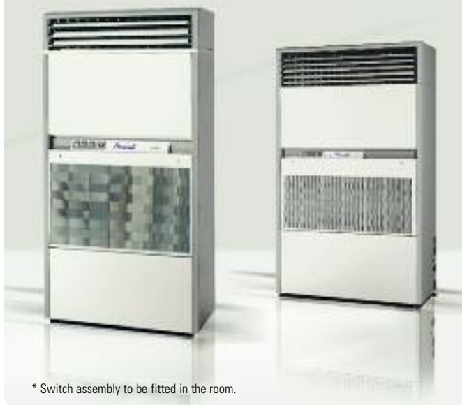
INDOOR UNIT X2450 AR*

* Switch assembly to be fitted in the room.