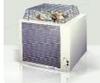
OUTDOOR UNIT UC 33-53