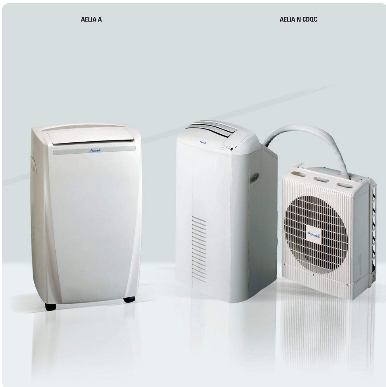
AELIA N CDQC