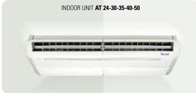
INDOOR UNIT AT 24-30-35-40-50

3 Cooling models From 6,7 kW to 10,5 kW 5 Heat Pump models From 6,97 kW to 14,53 kW