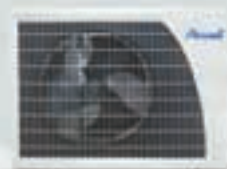
OUTDOOR UNIT GC 18-24