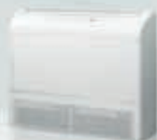
INDOOR UNIT SX SP 12-15-18