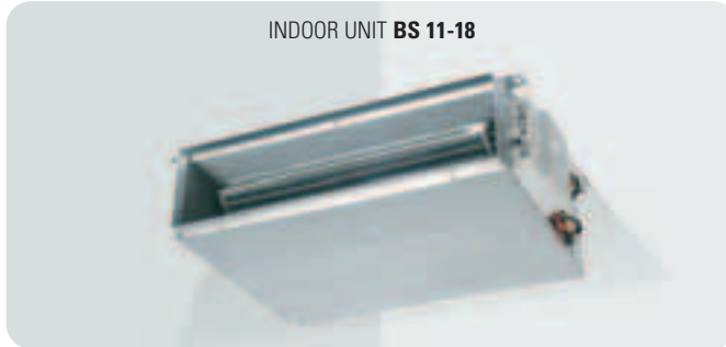
INDOOR UNIT BS 11-18

6 Cooling models From 3,2 kW to 12,9 kW 7 Heat Pump models From 3,2 kW to 13,77 kW